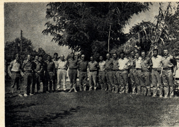
● The Force Commander with a number of 20 Infantry Group Officers on the occasion of his leave-taking visit.

In Cyprus the story has been happier, though here too there have been moments of sadness. 3 Inf. Gp. veterans