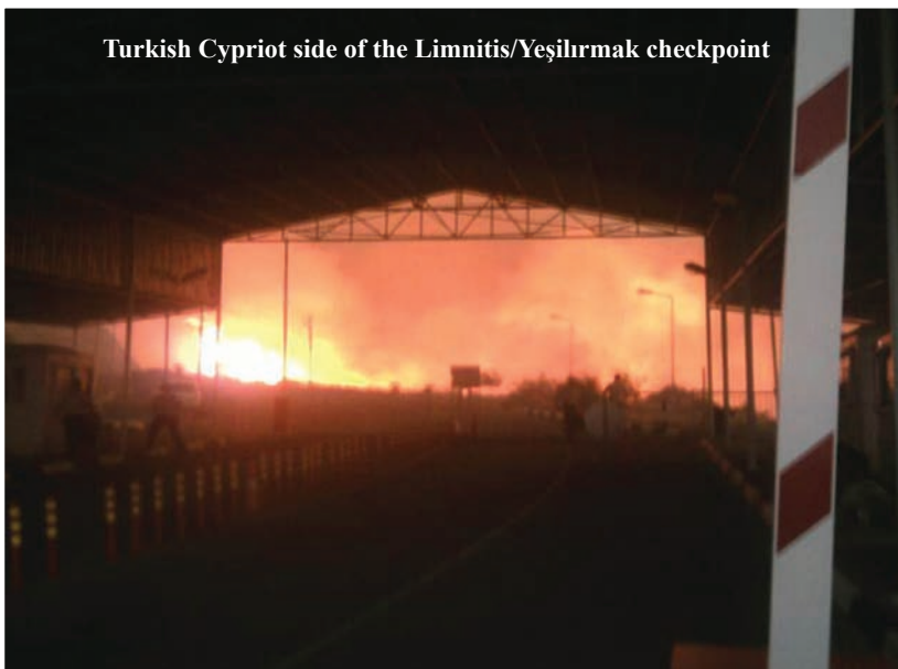
Turkish Cypriot side of the Limnitis/Yeşilirmak checkpoint