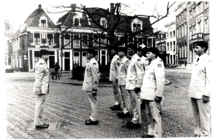
The RCD Guard in Leeuwarden, Holland.

Being much closer to Holland this year with our deployment to