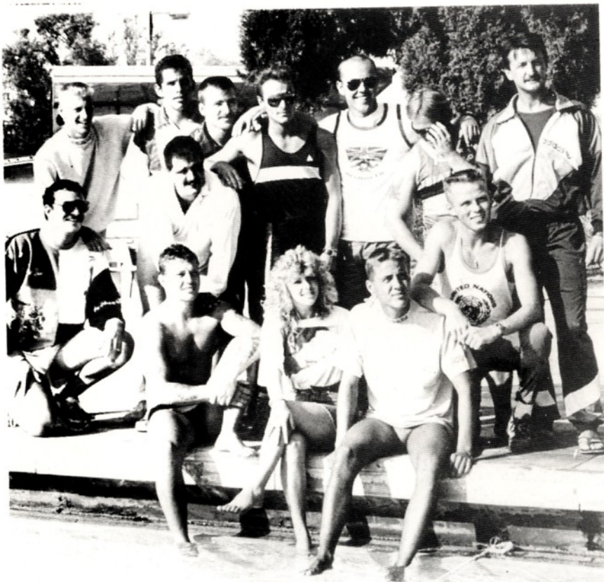
Members of HQ Battery swimming team pose with Miss 3 RHA prior to the start of their 24 hour charity swim for the Hillsborough Disaster Appeal Fund.

By the time this article is published in the Blue Beret, the British Contingent in Sector 2 will have rotated. 3rd Regiment Royal Horse Artillery will be firmly back in Paderborn, West Germany, or having some well-earned leave.