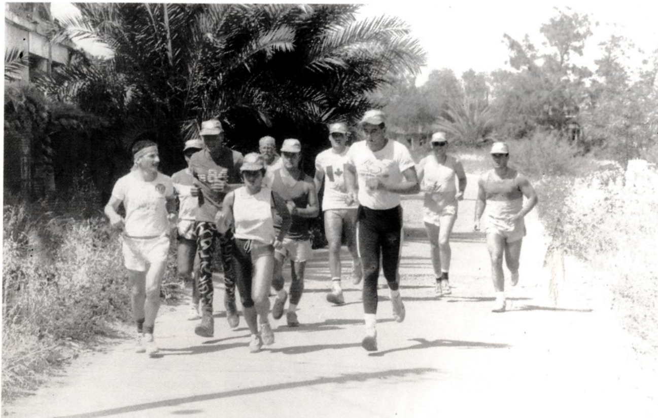
Running through Nicosia