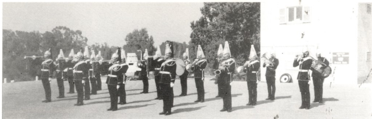
The Band of the Life Guards.