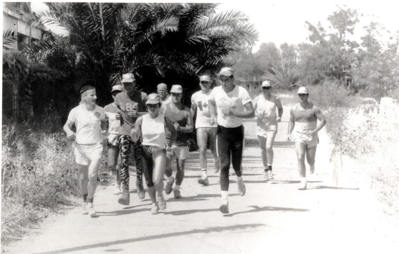
Running through Nicosia